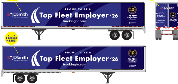
2 SIDES & REAR