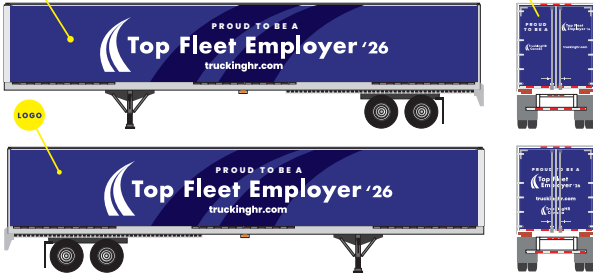
2 SIDES & REAR