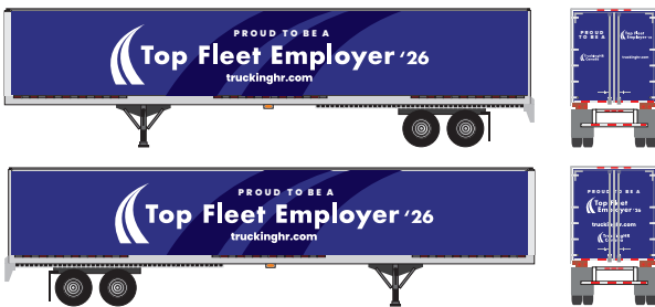
2 SIDES & REAR