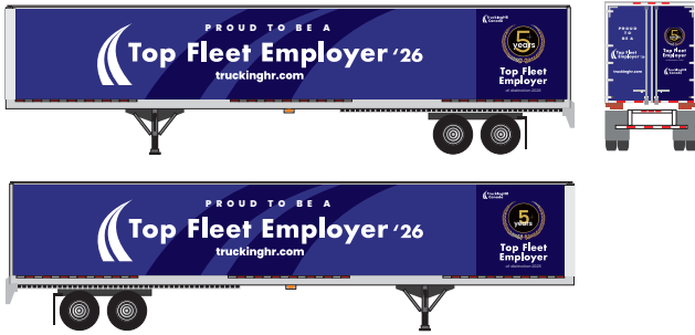
2 SIDES & REAR