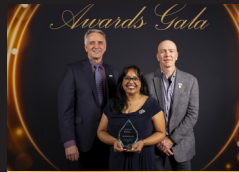
Top Medium Fleet Polaris Transportation Group