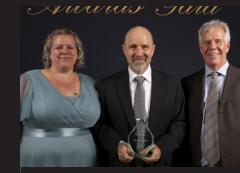
HR Leadership Challenger Motor Freight