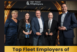
Top Fleet Employers of Distinction 10+ years Challenger Motor Freight, Edge Transportation Services Ltd., Liberty Linehaul Inc., Linamar Transportation Inc., Ryder Canada Supply Chain Solutions, Triton Transport Ltd