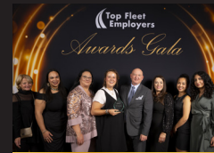
Top Large Fleet XTL Transport Inc.