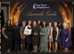
Community Engagement XTL Transport Inc.