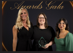
Women in the Workplace Armour Transportation Systems