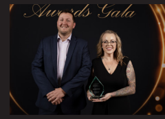
HR Innovator Wellington Group of Companies