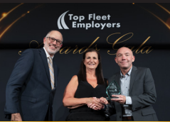
Top Small Fleet Classic Freight Transport