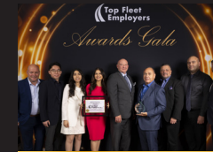
Top Private Fleet/ Fleet Services Walmart Fleet ULCHR