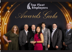
Training and Skills Development Bison Transport