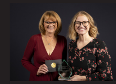
Workplace Diversity & Inclusion KAG Canada