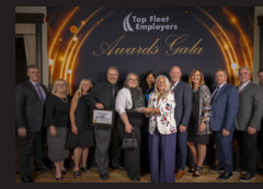
Workplace Culture Parkland Corporation